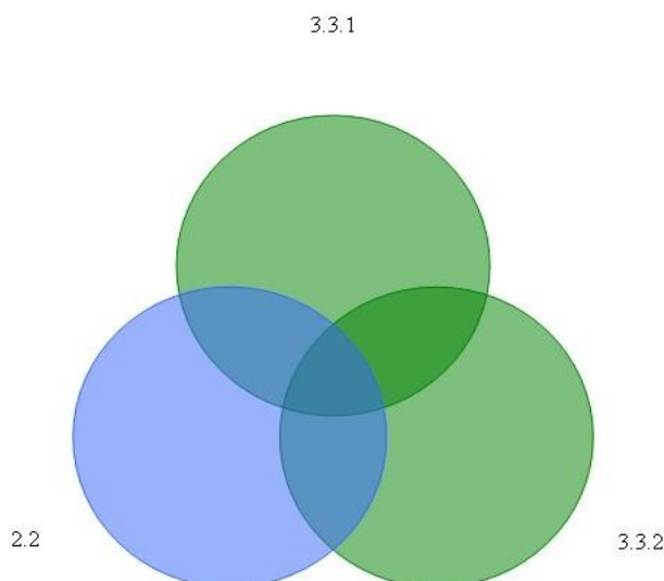
Diagram 1 Information science as an intersection of three field at two levels of reality

well as their information technology (3.3.1) relates to the third level. Hence, an information science subject lies in the intersection of the second and the third level.